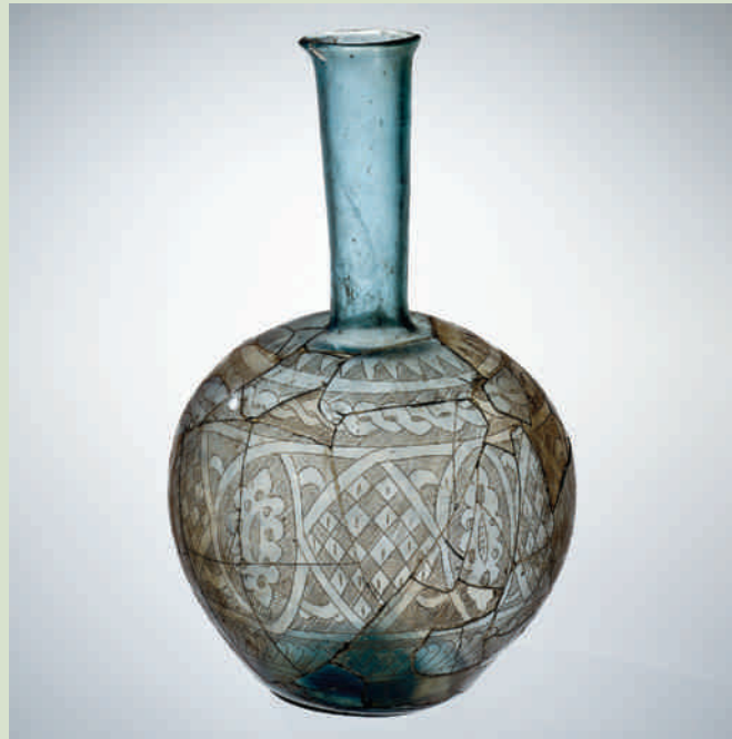
The Corning Museum of Glass, 68.1.1

Islamic Glassware This glass bottle from Syria shows the skill of Muslim chemists and artisans in producing clear, transparent glass. The scratched decoration reflects the Muslim taste for geometric design.